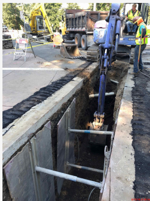
2019 Construction in Ross

We begin 2020 and the new decade with a look back at the many accomplishments made during 2019 - and a look ahead. We ended the year on a high note with two no-spill months during wet weather, and have had only one minor hillside spill in January, which did not reach surface waters and was quickly cleaned up.