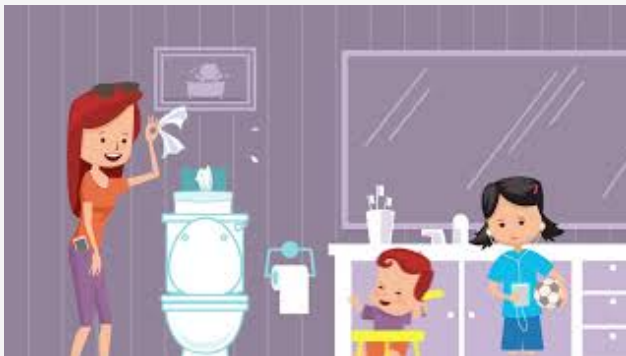
Remember - Please DON'T flush wipes!

Click here for more information about how to properly dispose of "flushable" wipes; Fats, Oils and Grease (FOG); expired and/or unused medications, and more!