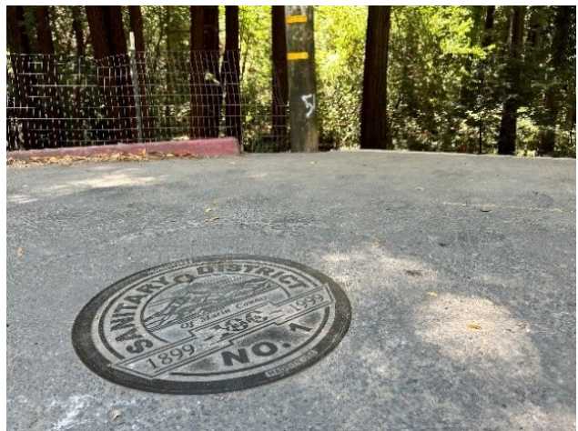
Ross Valley Sanitary District manhole in Larkspur.

To temporarily remedy the emergency, field staff promptly restored the functionality of the pipe to avoid an overflow situation. The engineering department then executed an emergency repair contract for both the damaged manhole and the aged pipeline, effectively addressing the identified defects. This important construction repair was accomplished in a narrow window of two days before the Town of San Anselmo's scheduled paving work – an excellent example of rapid field response, nimble public works implementation, and interagency coordination!