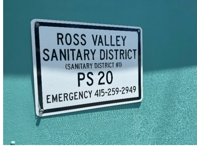
Sign on Lift Station 20.

Visit the project webpage for more information and updates.