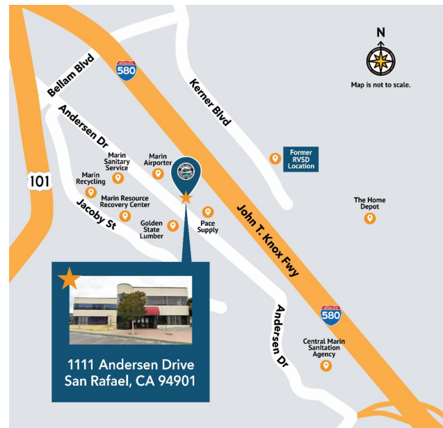
Map Overview of 1111 Andersen Drive.