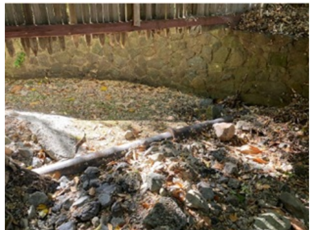
Sewer crossing Tamalpais Creek in Kent Woodlands.

Please remember, if you see a public sewer emergency such as a manhole overflow, leaking pipe, or sewage on the ground, please call the RVSD Emergency Line 24/7 at 415-259-2949 as soon as possible . When making an emergency call, be prepared to provide your name, phone number, and address where the incident occurs. After-hours calls will route to our on-call staff for immediate assistance.