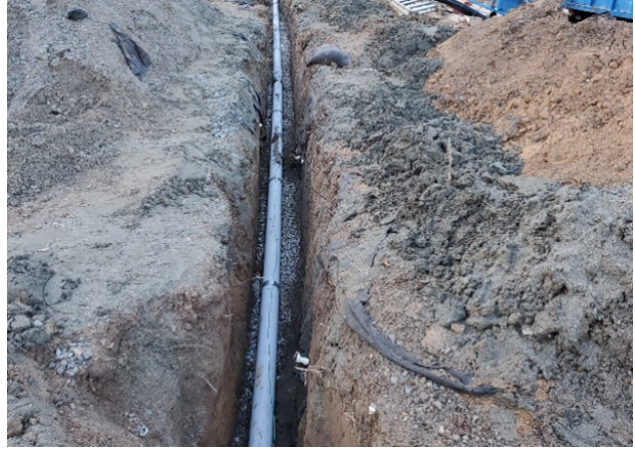
A sewer lateral in a trench.