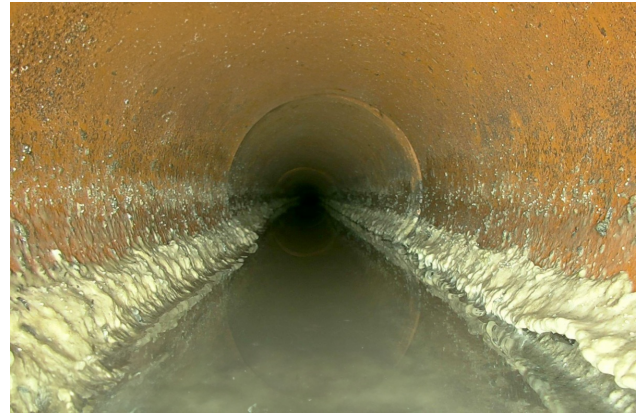
FOG buildup in a pipe.