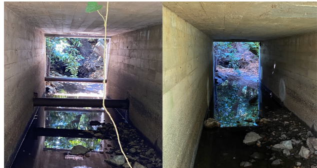
Before and after sewer removal.

RVSD's Infrastructure Asset Management Plan update of 2021 identified sewer creek crossings in the Kent Woodlands area as the highest priority for upgrading based on a District-wide risk assessment. Replacing these sewers significantly reduces the risk of contamination to Tamalpais Creek and potential damage to the sewer main. It is essential to rehabilitate sewers that cross creeks as they have a higher likelihood of failure due to natural forces associated with storm waters and a higher consequence of failure through more direct spills and contamination. Visit the project webpage for more information and updates.