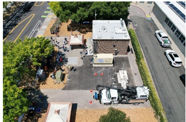
Drone footage of Pump Station 14.

Pump station staff are diligently engaged in the revision of the District's Emergency Response Plans (ERPs) for Lift Station 21 (Hwy 101), Lift Station 31 (Via la Brisa), and Pump Station 10 (Larkspur Landing B). These ERPs serve as essential guides for staff, offering precise instructions on how to effectively manage pump stations and establish bypass systems in the event of power outages or equipment malfunctions. To enhance preparedness, staff worked with a contractor to obtain drone footage of low-elevation manholes that are considered vulnerable in case of a station failure and used this information to update current maps. This initiative is in response to a state-mandated update of the District's Spill Emergency Response Plan (SERP).