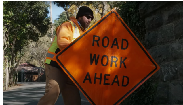
RVSD staff prepping for repair work.

RVSD Staff successfully finished two projects that amounted to removing 315 feet of abandoned gravity lines within the District's service area. As one of the oldest sanitary districts in California, staff occasionally come across legacy lines that are no longer in use. To remove the lines, staff seal the pipe in the manhole. Sealing these abandoned lines helps prevent infiltration and debris from entering the system, reducing the likelihood of a potential spill. The two abandoned lines include a 300 ft pipe in Fairfax and a 15 ft pipe in Sleepy Hollow.