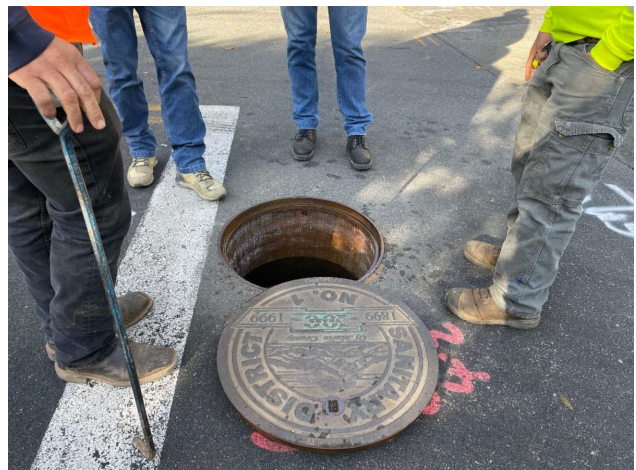
Open manhole surrounded by project team.

The primary goal of this rehabilitation is to mitigate the risk of sanitary sewer spills caused by either blockages or excessive infiltration and inflow (I&I) of stormwater. It includes rectifying defects that could allow roots and sediment to block the sewer and sealing leaks to reduce inflow and infiltration during wet weather. Visit the project webpage for more information and updates.