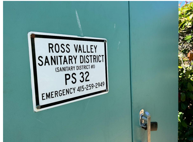
Lift Station 32 (Riviera Circle, Larkspur).

To avoid major sewer spills, pump stations in the District must operate at all times, including during power outages. Amid a planned PG&E power outage for replacing an electrical transformer, staff needed to supply temporary power to Lift Stations 31-36 (Riviera Circle in Larkspur). The operations and maintenance team took advantage of the situation to offer hands-on training with portable generators to pump station staff. This extensive training encompassed the setup, transfer, and operation of the stations during emergencies. Knowing how to safely supply temporary power is significant for pump stations and on-call staff, especially during unexpected power outages that may occur during a storm.