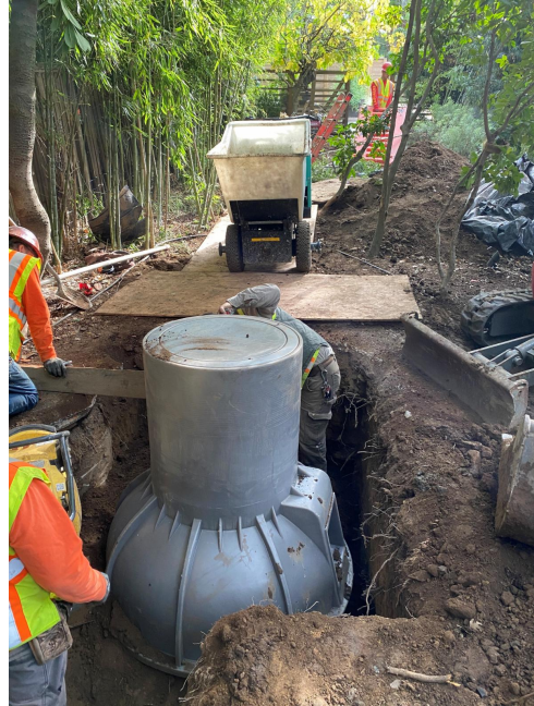
Contractor installing HDPE plastic manhole in an easement.

RVSD's Infrastructure Asset Management Plan update of 2021 identified sewer pipe creek crossings in the Kent Woodlands area as the highest priority for investment based on a District-wide risk assessment. Replacing these sewers significantly reduces the risk of contamination to Tamalpais Creek and potential damage to the sewer main. It is essential to rehabilitate sewers that cross creeks as they have a higher likelihood of failure due to natural forces associated with storm waters, and a higher consequence of failure through more direct spills and contamination. Visit the project webpage for more information and updates.