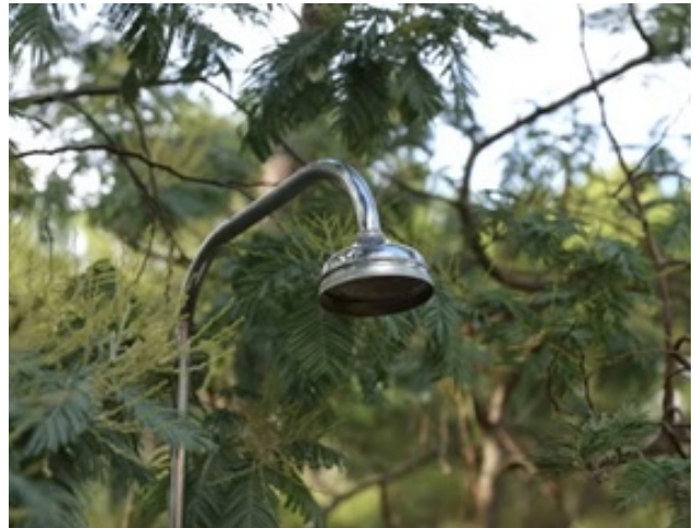
Non-compliant outdoor shower.

Click here to view more information about Outdoor Drainage Fixtures on the District website.