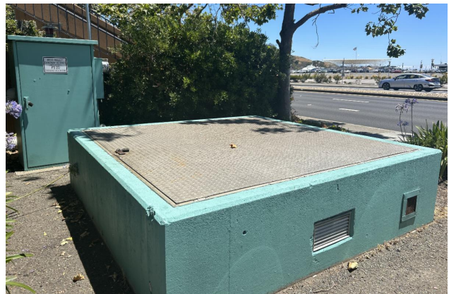
Pump Station 20

New electrical control panels, communications equipment, and flow meters will improve reliability of the lift stations and allow for faster response times to issues at each station. Electric and mechanical equipment for this project is scheduled for delivery over the next month.