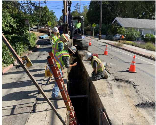
Construction crew working on sewer installation.

Visit the project webpage for more information and updates. Click here to learn more about RVSD access to public utility easements on private property for essential routine maintenance and repairs.