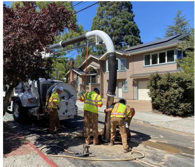
Repair crew hard at work.

In March, staff successfully completed sixteen trenchless point repairs in various locations including Larkspur, Greenbrae, Kentfield, Fairfax, San Anselmo, and Ross.