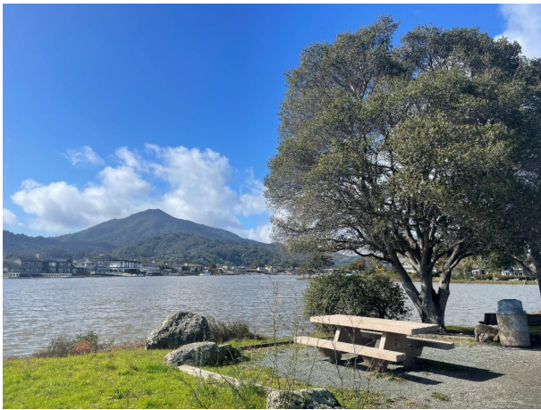
Corte Madera Creek

As we spring out of the month of April, we hope everyone had an enjoyable Earth Day on April 22, celebrating our clean waterways here in the beautiful Ross Valley. In this newsletter, we are pleased to share the achievements of our staff who work hard to maintain our beautiful environment through an efficient and reliable sewer collection system.