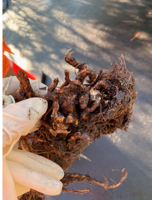
Root ball found inside public sewer.