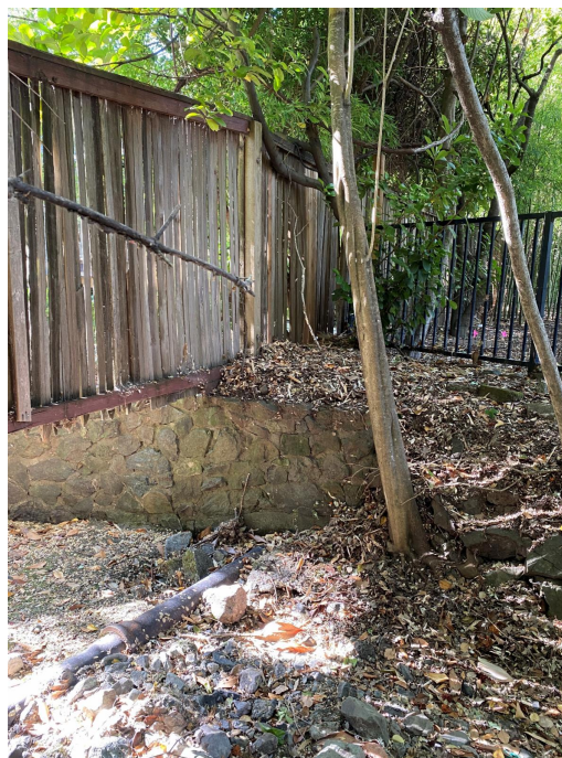
Sewer pipe in creek.

Visit the project webpage for more information and updates.