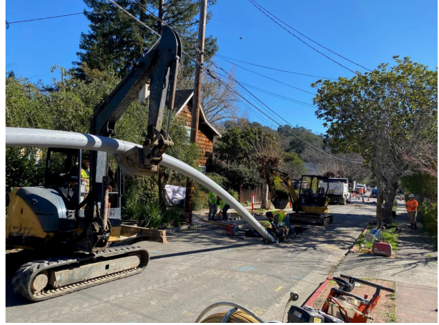
Construction crews working on pipe rehabilitation.

Visit the project webpage for more information and updates. Click here to learn more about RVSD access to public utility easements on private property for essential routine maintenance and repairs.