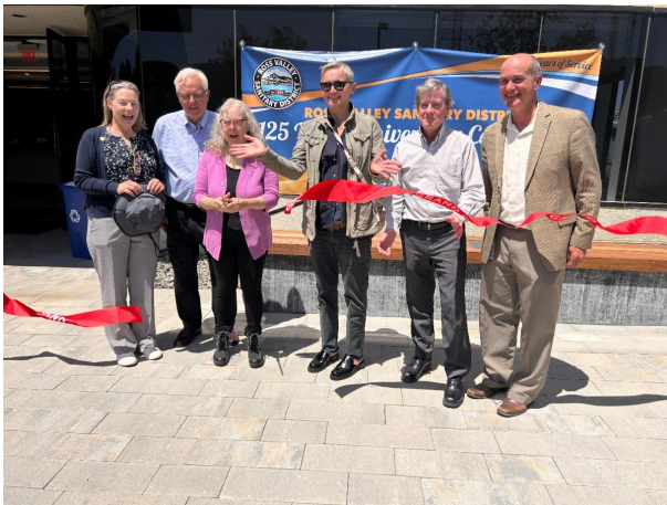
125th Anniversary & RVSD Headquarters Consolidation Ribbon Cutting

Another month at RVSD has been marked by significant milestones and achievements. The highlight was undoubtedly the May 28th celebration of RVSD's 125th year of continual service in Marin County and the inauguration of our headquarters at 1111 Andersen Drive in San Rafael signifying a new chapter in our commitment to serving our community with excellence.