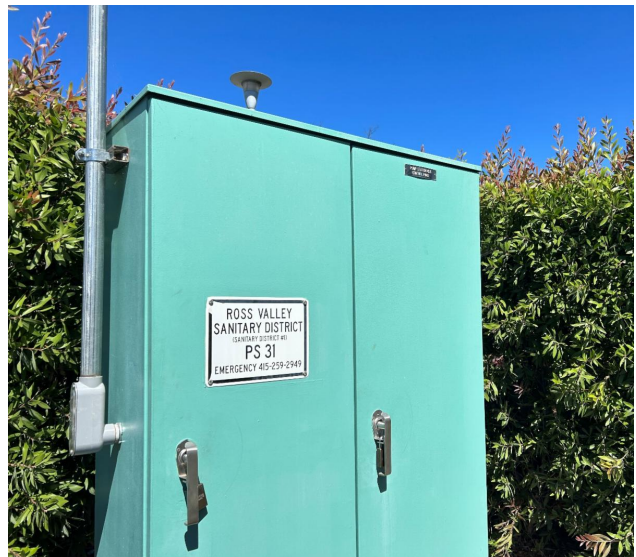
Pump Station 31

Visit the project webpage for more information and updates.