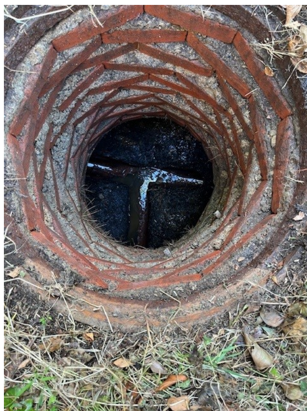
Historic manhole found in Greenbrae

It's noteworthy to observe the evolution of manhole construction over the years—from the traditional use of brick and mortar or stone in the 19th century to the adoption of modern materials like HDPE.