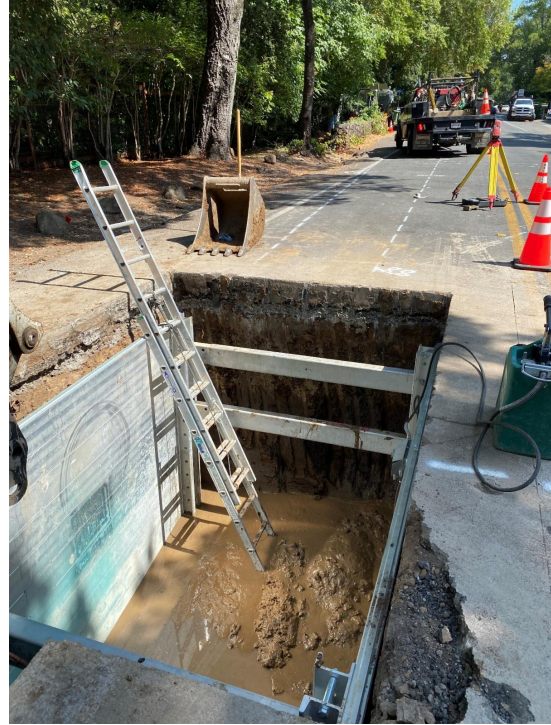
Construction trench holding water

Visit the project webpage for more information and updates.