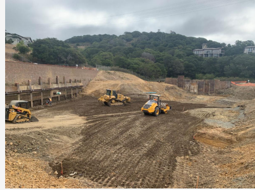
Larkspur Landing cleanup site showing shoring walls, excavations and partial backfilling with imported clean fill.

vegetation at the completed site. The major construction activities are anticipated to be complete in August.