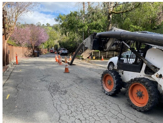
Glosage installing new HDPE pipe

Work on the Wolfe Grade easement and Sir Francis Drake Blvd in Greenbrae is complete. Work on Santa Barbara Ave., Santa Cruz Ave., and Salinas Ave. is also complete. Work on Deer Hollow Road in Sleepy Hollow is almost complete, except for the final paving. The contractor is now working on The Alameda and Caleta. Ave in San Anselmo. Visit the project webpage for more information and updates.