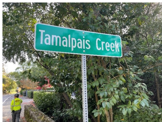
Tamalpais Creek street sign

Staff is applying for permits at the US Army Corps of Engineers, Regional Water Quality Control Board and California Department of Fish and Wildlife. Visit the project webpage for more information and updates.