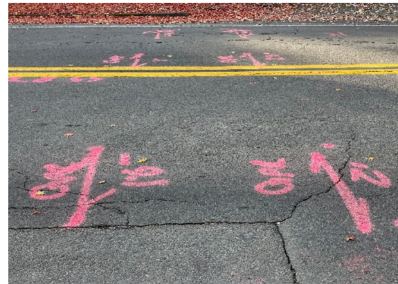
Example of utility markings on a road

Thinking about doing underground work on your property? Make sure to call USA North 811 before you dig! 811 will notify the affected utility companies of your project, and the utilities will send a locator to mark the approximate location of a buried utility. Public utilities are buried on private property throughout Marin County, so don't forget to call 811!