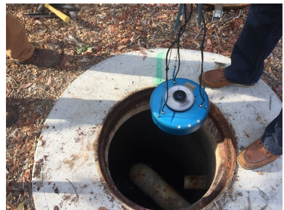
Placing an IBAK panoramic camera in a manhole

After collecting the footage, staff review the video, code the visible defects, and upload the coding data to the District's infrastructure management software. Higher risk defects are then ranked as higher priorities for manhole rehabilitation or replacement in our repair and capital programs. Completing manhole assessments is another contribution towards the District's commitment to complete work recommended in our 2021 Infrastructure Asset Management Plan (IAMP) .