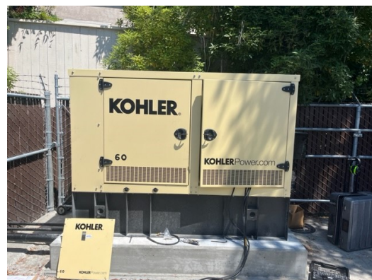
New Generator at PS 24.

Having standby backup power at these facilities is critical to ensure wastewater does not back up and flood buildings, streets, or nearby Corte Madera Creek when there are power outages in this area near the hospital. Visit the project webpage for more information and updates.