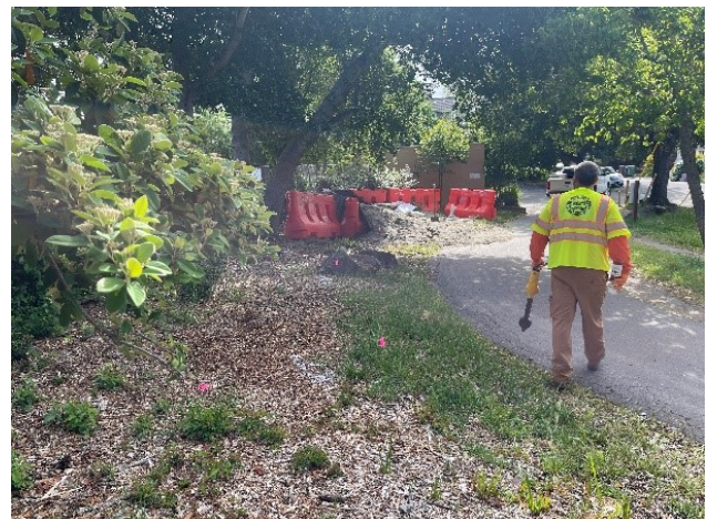
Condition Assessment Crew Marking the Storm Drain with Flags.

This flooding significantly hampers the District's response and contributes to infiltration issues through the shared infrastructure of the station.