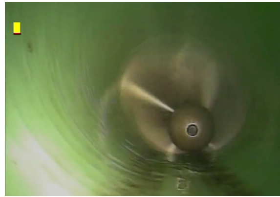
Hydro Jetter Nozzle in a Sewer Pipe.

While cleaning the sewer easement, the homeowner allowed staff to observe the house as the crew jetted the line below. This collaborative effort helps prevent any sewer spray damage to our customers' buildings and resultant claims against the District.