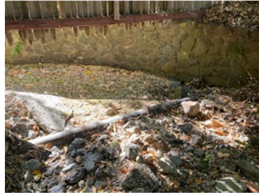
Sewer Crossing at Tamalpais Creek in Kent Woodlands.

The final design is complete, and the project is out to bid. The District's Infrastructure Asset Management Plan update of 2021 identified sewer creek crossings in the Kent Woodlands area as the highest priority for upgrading based on a District-wide risk assessment. Bids will be opened on August 3. Visit the project webpage for more information and updates.