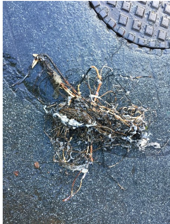
Sewer Root Ball.

They investigated the cause of the root intrusion and removed the roots and debris to prevent potential system blockages. Their proactive approach minimized traffic-related impacts, ensuring the process was completed smoothly and efficiently.